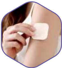
Transdermal Delivery System (TDS Patch)